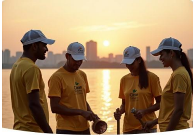
Colombo Clean-Up Day

The project focuses on engaging local communities, public and private sector organizations, donor community, media agencies, and NGOs/INGO sectors. Clean Sri Lanka project invites you to join upcoming events as follows and schedules of the events will be announced on Clean Sri Lanka website.