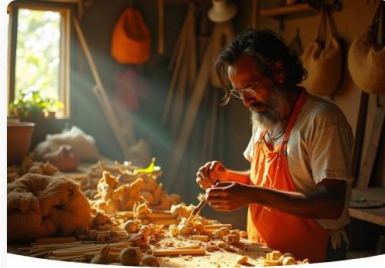
Green Living Workshop