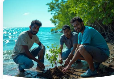
Mangrove Restoration Drive

If you wish to contribute Clean Sri Lanka project, the opportunity has been formed to receive donations as well. Clean Sri Lanka project in the process of integrating a secure online payment gateway to enhance your donation experience. This feature will be available soon, ensuring seamless and convenient transactions. In the meantime, you can make your generous contributions via bank transfer.