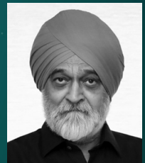
KEYNOTE SPEAKER Montek Singh Ahluwalia Deputy Chairman of the Planning Commission of the Republic of India (2004 to 2014)

28TH & 29TH NOVEMBER 2023 SHANGRI-LA HOTEL - COLOMBO, SRI LANKA